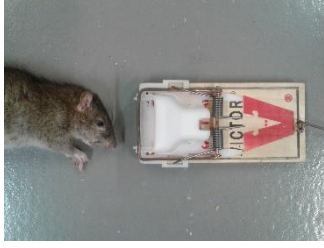
347.9 g male