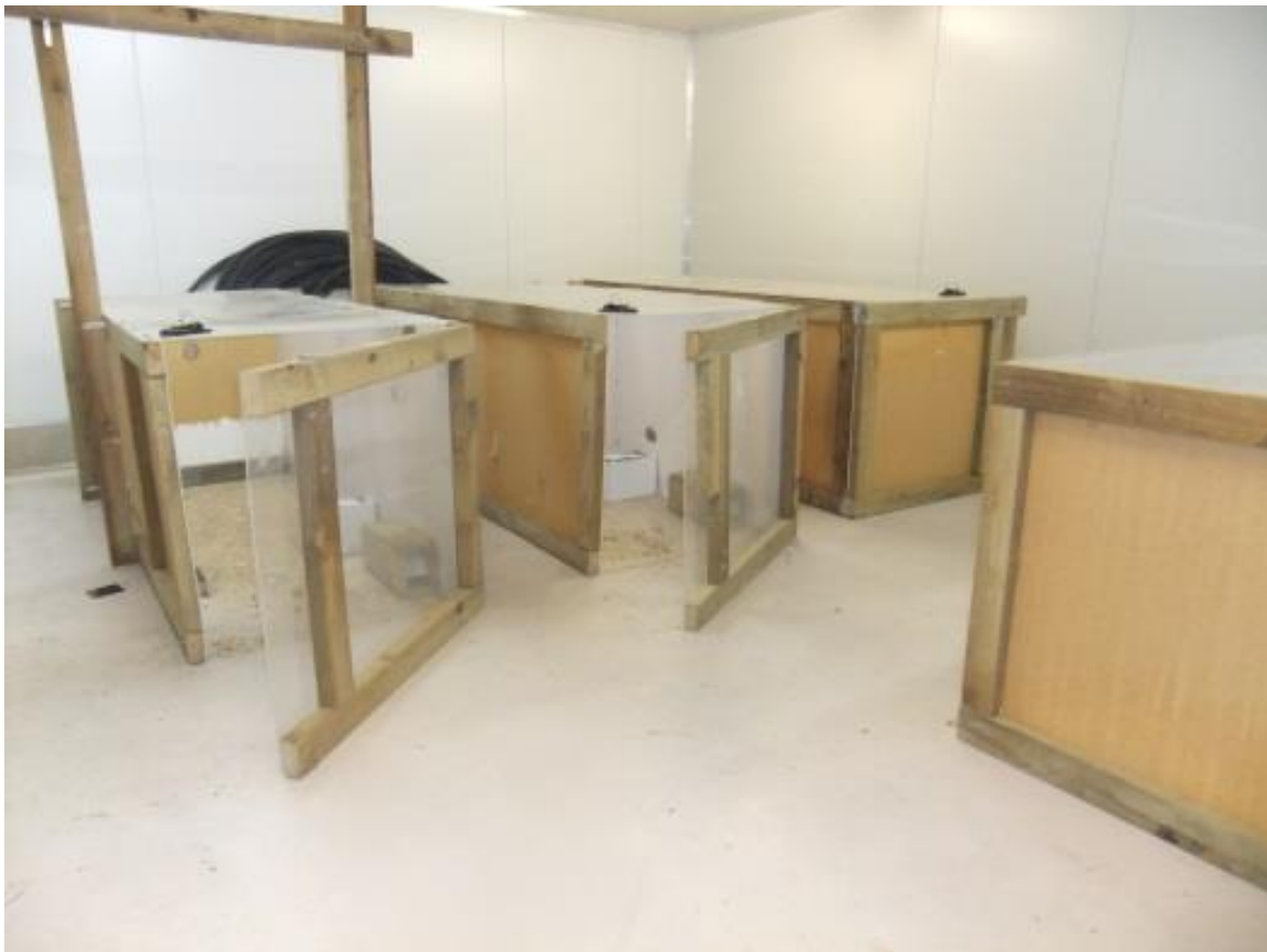
Figure 1. The four arenas used for trap testing. Rats were provided with a nest box, had free access to water, and were fed with standard rodent pellets (ProLab RHM 1800 LabDiet, PMI Nutrition International, MO, USA). Two arenas are shown with Predator Free NZ wooden trap tunnels in place.

Wild-caught rats were acclimatised to captivity in cages before being transferred to test arenas for the trap testing (Figure 1). Rats were confined individually in each arena and tested in a free-approach test during late afternoon or evening. In each arena, a trap was set in a Predator Free NZ wooden tunnel (Figure 2).