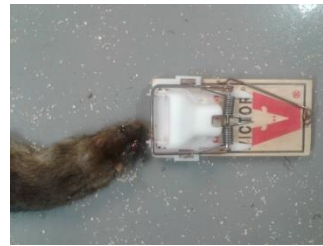
295.8 g male