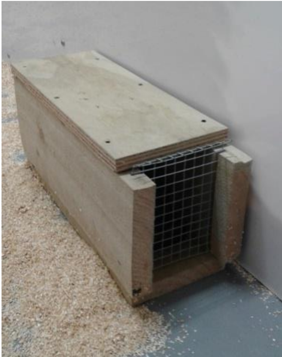
Figure 2. The Predator Free NZ wooden trap tunnel. A 50 × 50 mm entrance hole was cut in the mesh at the far end of the tunnel (not visible) and the mesh at the closed end of the tunnel was removable to allow access to the trap. The Victor® Professional rat trap or Modified Victor stoat and rat trap was set 1–2 cm into the tunnel from the closed end. Two tacks were nailed into the trap tunnel floor in front of the trap to prevent it being pulled forward by a rat or pushed too close to the entrance hole in the front mesh when deployed.

When a rat was struck by the trap, the time to loss of palpebral (blinking) reflex was measured to determine whether the trap had rendered the captured animal irreversibly unconscious within 3 minutes. For the trap to pass the NAWAC trap-testing criterion (2011) as a Class B trap, 10 of 10 rats needed to be rendered irreversibly unconscious within 3 minutes. Once irreversible unconsciousness was identified, a stethoscope was used to determine cessation of heartbeat.