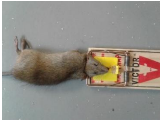
220.3 g male