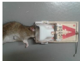
271.8 g male