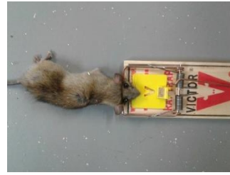
102.1 g female