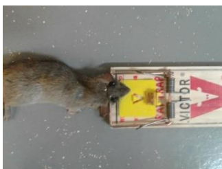
145.7 g male