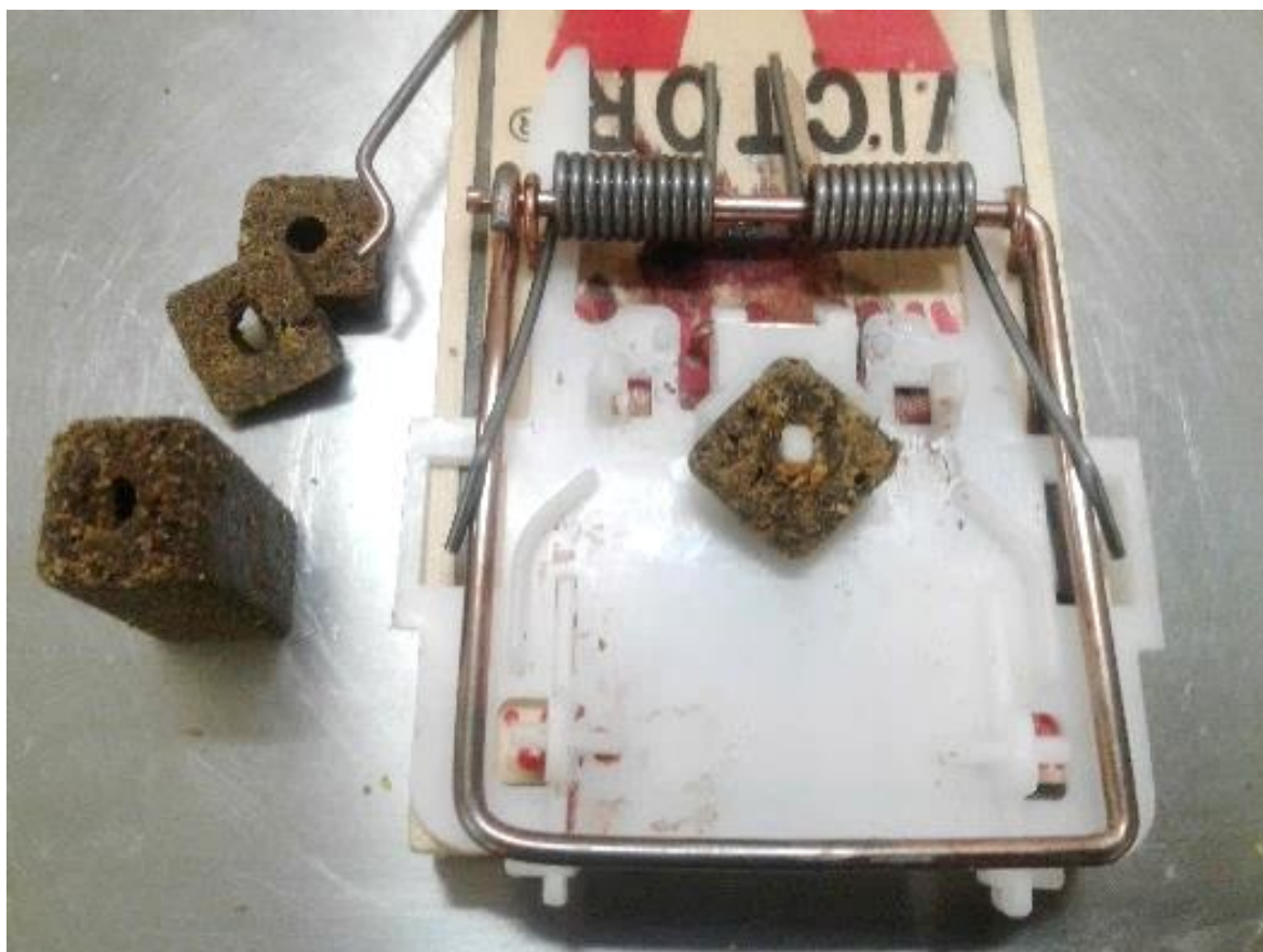
Figure 4. Baited unset Modified Victor stoat and rat trap showing method of baiting (shroud removed) with Mustelid and Cat lure block and slices.

The traps were set inside Predator Free NZ wooden tunnels as in tests 1 and 2. The trap was baited with a slice of Mustelid and Cat lure 3 smeared with either a small quantity of bacon fat or smooth peanut butter on the upper surface of the lure (Figure 4). Testing was carried out from 13 to 28 February 2019.