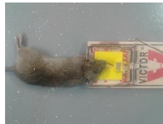
105.5 g female