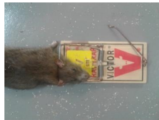
321.1 g female