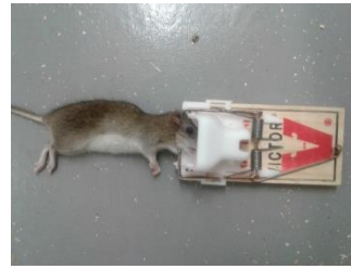
129.2 g female