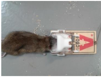
217.6 g male