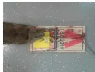
243.5 g male