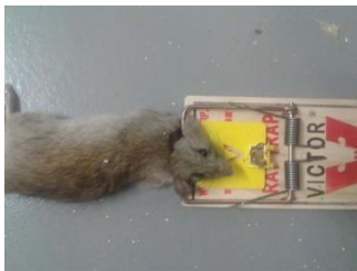
126.1 g male