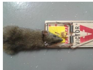
162.9 g female