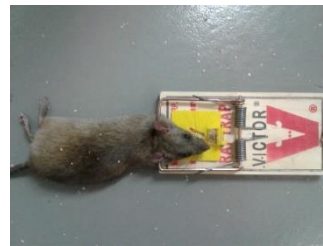
137.1 g female