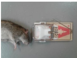
415.1 g male