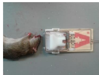
305.8 g male