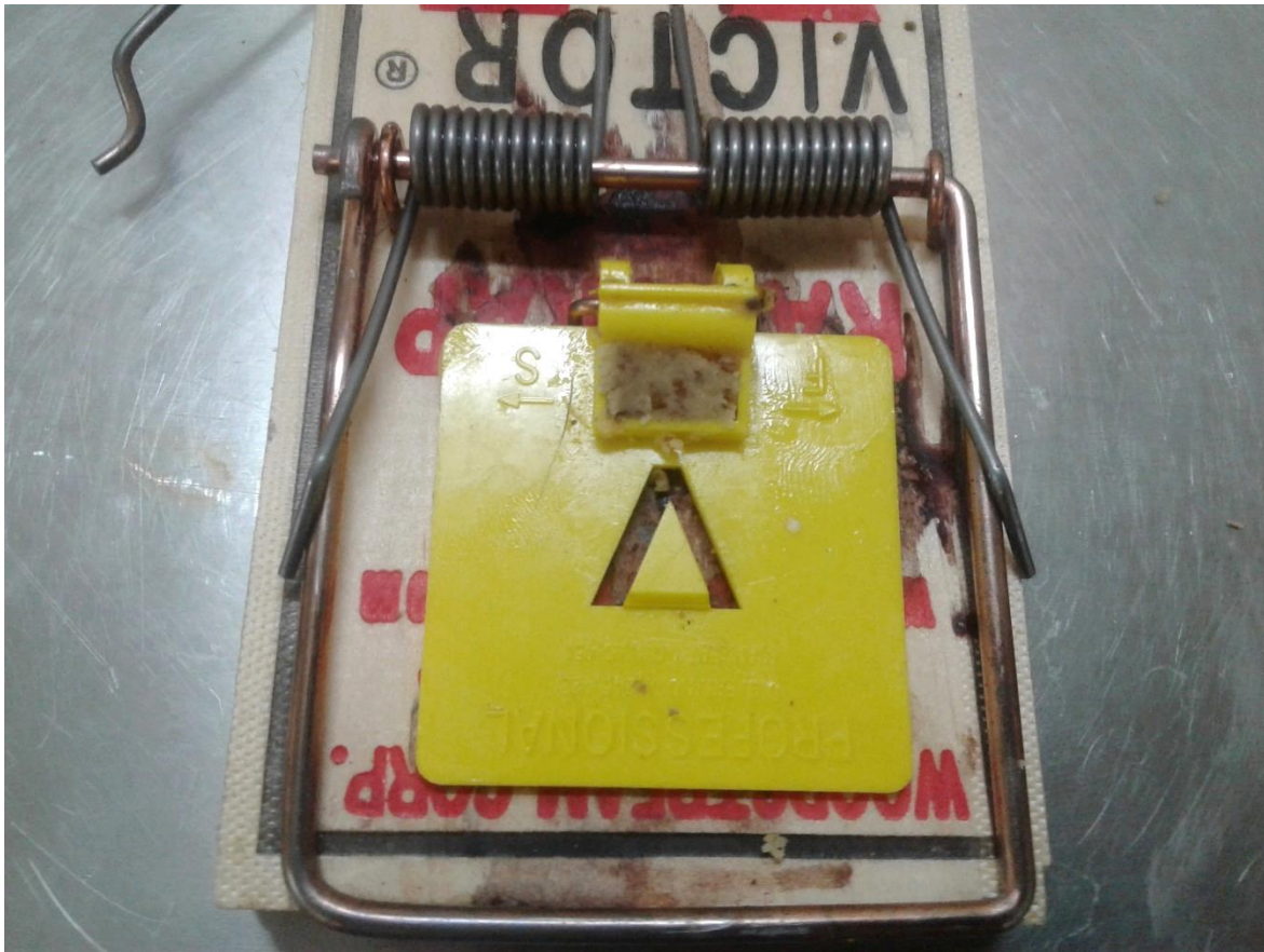
Figure 3. Baited unset Victor® Professional rat trap showing placement of bait in the purpose-made bait-well.

The traps were set in Predator Free NZ wooden tunnels and baited with either walnut paste, Nutella® or smooth peanut butter, applied in the purpose-made bait well near the pivot on the yellow treadle (Figure 3). Once set, the trap was placed in the tunnel so that the back edge of the trap was about 1–2 cm in from the rear mesh, so that there was enough room in front of the trap to allow a rat to fully enter the tunnel. Two tacks were nailed into the trap tunnel floor in front of the trap to prevent it being pulled forward by a rat or pushed too close to the entrance hole in the front mesh when the trap was placed in the tunnel. Testing started on 27 November 2018 and was completed on 9 December 2018.