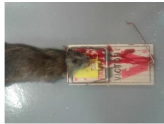
338.1 g male