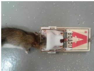
240.3 g male