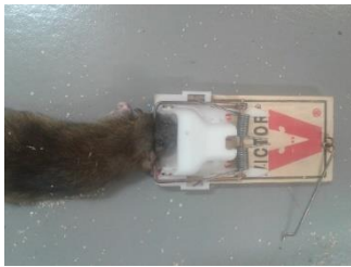
228.7 g male