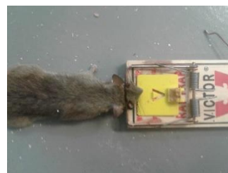
124.4 g male