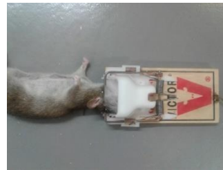
206.4 g female