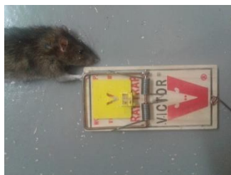
277.3 g male (fail)