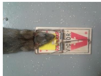
238.8 g male