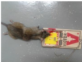
169.5 g male