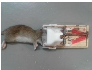
150.9 g female