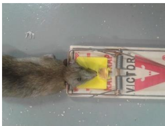
163.1 g male